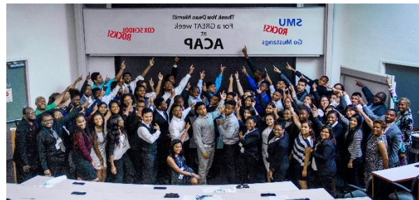
Dallas ACAP 2015