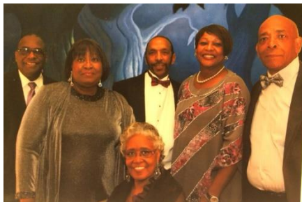
High School Alumni Association: Class of 1969