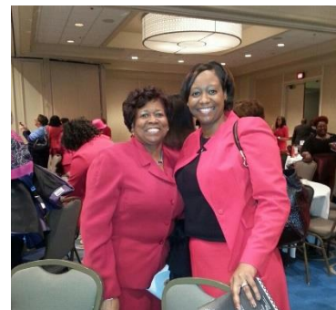
Deltas: Wife & Daughter