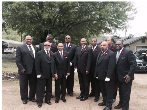
Fraternity Line Brothers of Spring '72