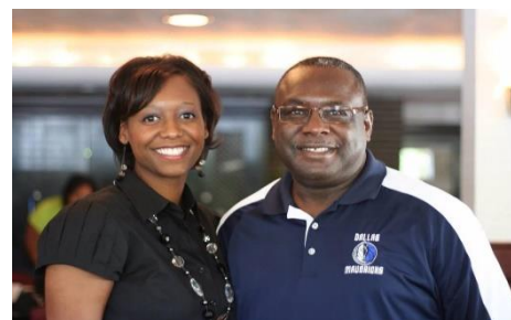
Father & Daughter