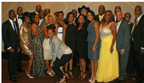
NABA National Convention: Las Vegas, NV--2015