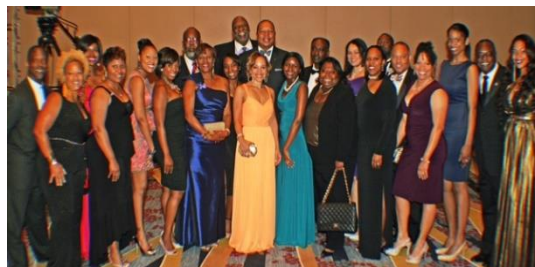
NABA National Convention: Washington, DC--2014